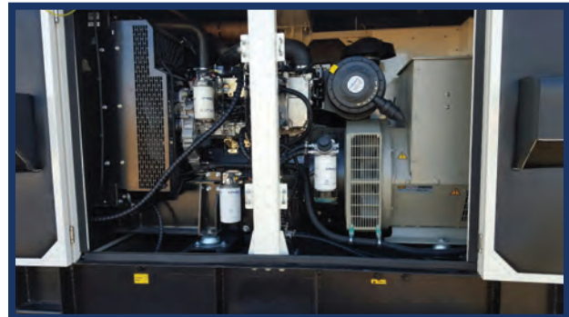
USER FRIENDLY ACCESS FOR MAINTENANCE