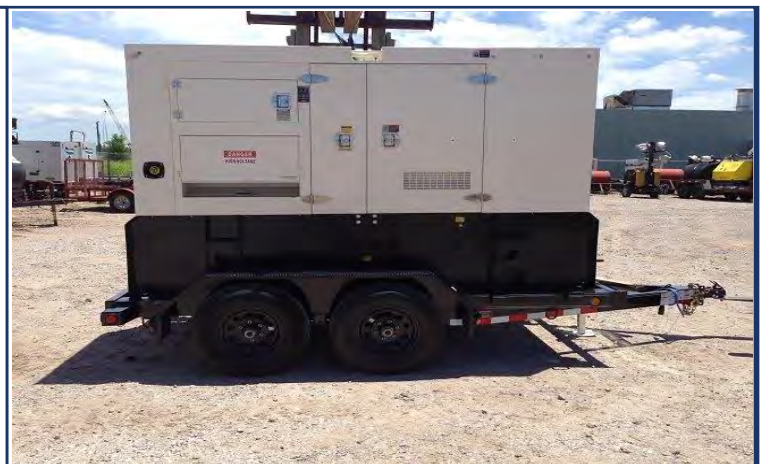
(Optional Toolbox & Spare Tire Available Upon Request)