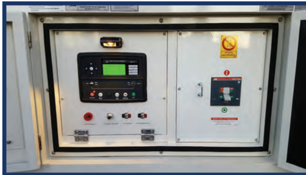
REAR CONTROL PANEL WITH MLCB