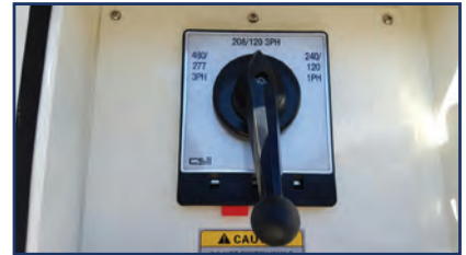
3 POSITION VOLTAGE SELECTOR SWITCH