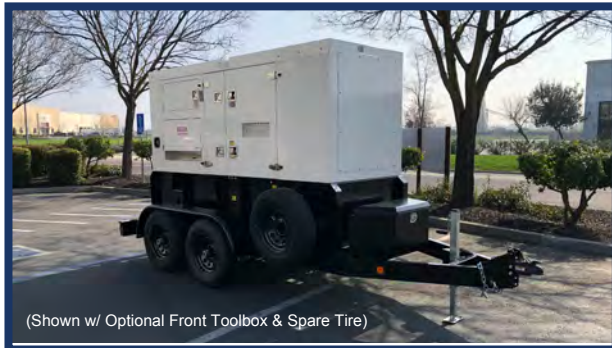
LARGE CAPACITY FUEL CELL