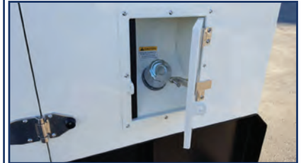
LOCKABLE EXTERNAL FUEL FILL