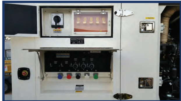
CUSTOMER CONNECTION PANEL