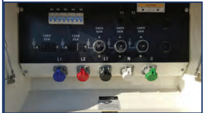
CUSTOMER CONNECTION CAM-LOK STANDARD